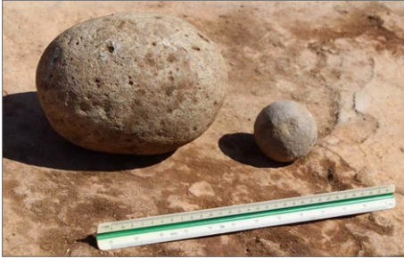
Fig. 5. Polishing stones of various sizes from the Dongolo archaeological site

crops, although identifying the specific types of grain requires further specialist analysis. The polishing stones from Dongolo also share characteristics with