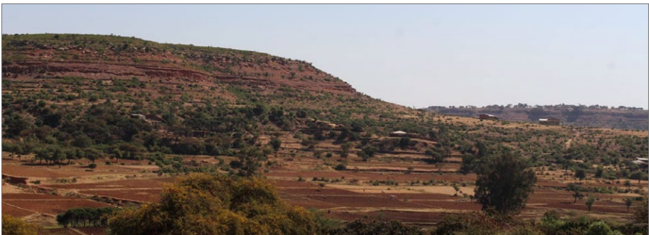
Fig. 2. View of the Dongolo site from the west

The results of this preliminary archaeological survey indicate that, although these sites were previously unknown, they are among the most promising archaeological localities in the region. The main findings include Aksumite stone-worked objects, bracelets and other metal artifacts, roughly dressed stelae, rectangular and circular well-dressed stone slabs, stone rubble, and indications of possible underground structures, as well as ceramic objects (both complete vessels and concentrations of potsherds). Both newly identified sites are situated near rivers and fertile land, which are among the main characteristics of most ancient settlement sites in the region that