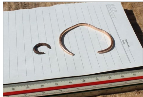
Fig. 9. Bracelet and finger ring from the Endameqabr archaeological site