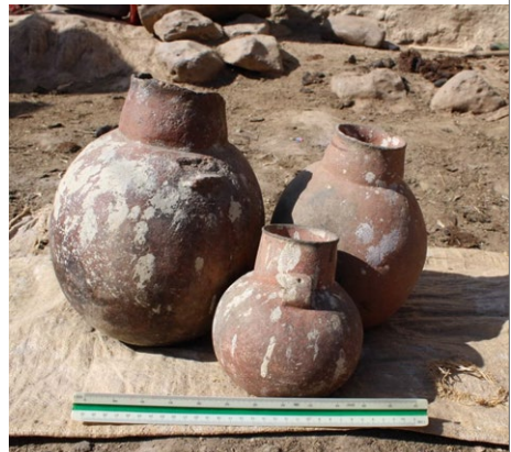
Fig. 7. Intact vessels (cups, bowls, and complete pots) discovered at the Endameqabr archaeological site, currently housed in a local residence