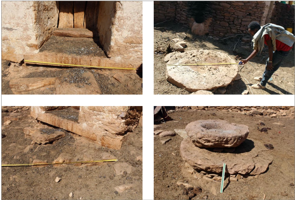
Fig. 3. Architectural remains (left to right): a rectangular, well-dressed stone slab reused in a modern wall, circular stone slabs, and exposed wall structures

The major finds at the site include architectural remains such as well-dressed circular and elongated rectangular stone slabs, concentrations of potsherds, complete ceramic pots and other vessel types, as well as metal objects. The presence of the architectural remains —such as dressed stone masonry and exposed wall structures— together with an abundance of other artifacts suggests the existence of an ancient village settlement in the area. Unfortunately, members of the local community are currently dismantling these structures for new house construction and agricultural purposes.