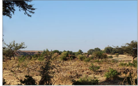
Fig. 6. The archaeological site of Endameqabr