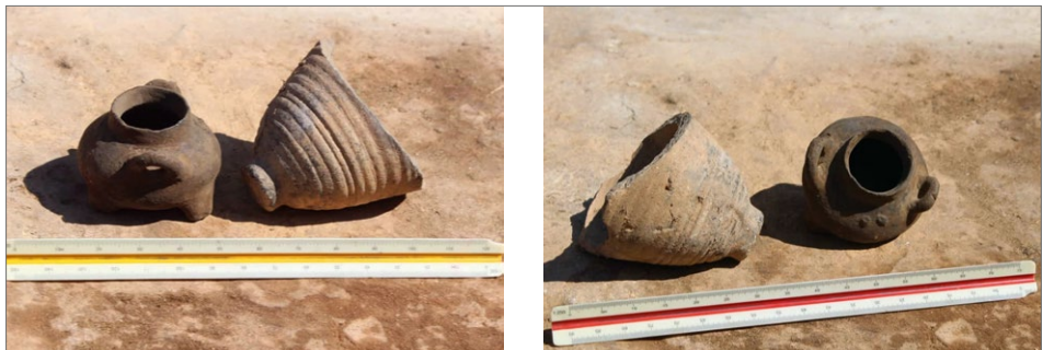
Fig. 4. A tripod vessel and a fragment of an amphora from the Dongolo archaeological site

Upper and lower grinding stones, as well as polishing stones of various sizes, were also identified at the Dongolo archaeological site. The size, shape, and raw material of these grinding and polishing stones vary. Most of them are carved from granitic-type raw materials and are similar in size and morphology to comparable artifacts still used in rural areas of the