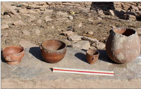
Fig. 8. Cups, bowls, and complete pots from the Endameqabr archaeological site, kept in a local household

The vessels are primarily made of light red ware and are brown in color, typical of early Aksumite ceramics. Their morphological features resemble those of complete vessels uncovered at the Proto-Aksumite and/or early Aksumite site of Bete Giorgis (Fattovich 1997: Fig. 5). Thus, the Endameqabr vessels can likely be dated to the Proto-Aksumite period, as Fattovich attributed similar finds to this phase. Some vessels are also characteristically similar to the early and classic Aksumite red ware pottery documented at Aksumite sites (Wilding 1989; Manzo 2003; Phillips 2004) [see Figs 7, 8].