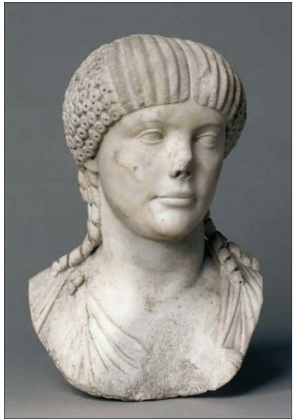
Fig. 12. Portrait head of a Roman lady (Octavia, wife of Nero), the Cleveland Museum of Art, inv. no. 103 (after Howard 1926, 9, fig. 2).