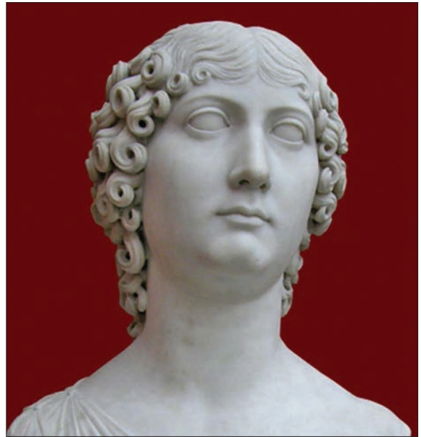
Fig. 17. Herm depicting Statia Quinta, Copenhagen (after Feijfer 2008, 287, pl. 25).