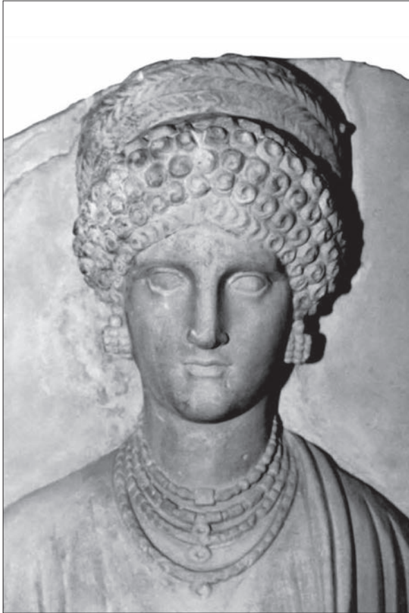
Fig. 14. Grave relief depicting a Roman woman, the Louvre, inv. no. MNB 2029 (after Poyiadji-Richter 2009, 185, fig. 4).