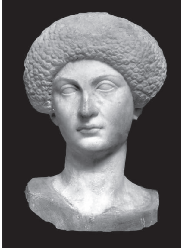
Fig. 6. Head of a young woman, probably Domitia, the Graeco-Roman Museum of Alexandria, inv. no. 3516 (after Savvopoulos, Bianchi 2012, 62, fig. 14).