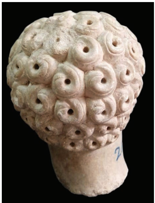
Fig. 4. Portrait head of a young man, the Maria Storeroom, inv. no. 218, back view.