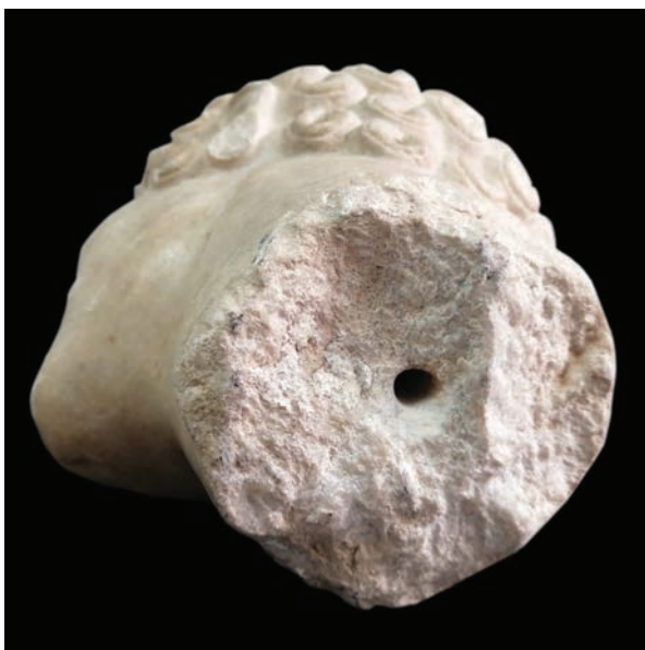
Fig. 3. Portrait head of a young man with a small hole at the bottom, the Maria Storeroom, inv. no. 218.