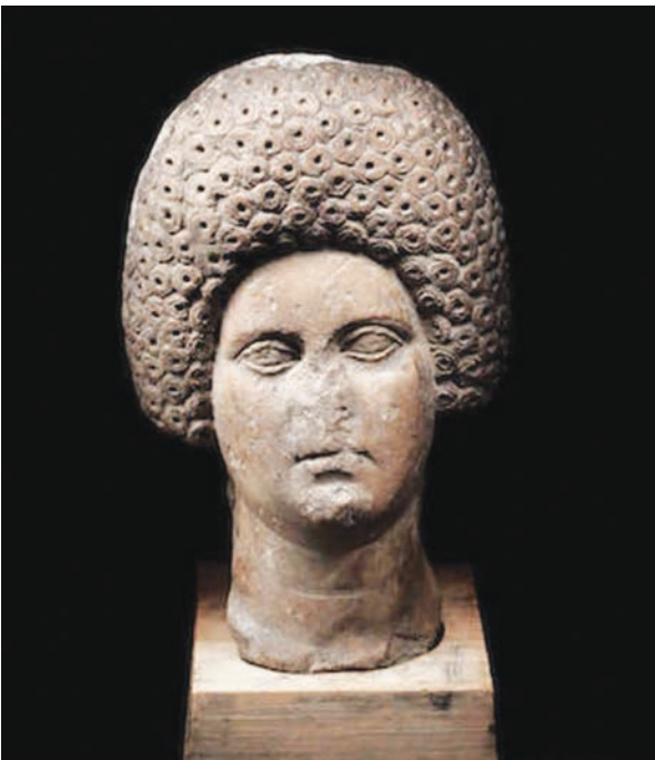
Fig. 7. Portrait head of Domitia, the National Roman Museum in Rome, inv. no. 57.261 (after Kleiner 1992, 179, fig. 148).