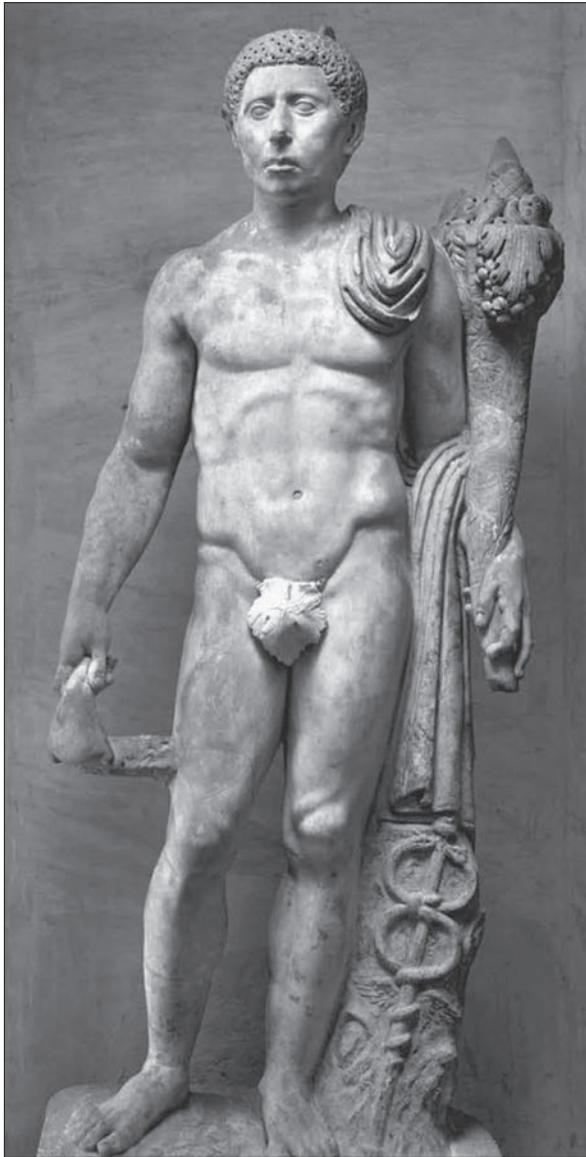
Fig. 9. Portrait of Marcia Furnilla, Copenhagen, inv. no. 711 (after Kleiner 1992, 178, fig. 146).

period. Another head of a Roman lady from Copenhagen (Fig. 8) with analogous drilled curls is dated to the early Flavian period. 4 The portrait of Marcia Furnilla from Copenhagen with a similar hairstyle (Fig. 9) is dated to the Flavian period. 5