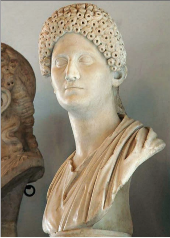
Fig. 5. Portrait head of Domitia, the Capitoline Museum, inv. no. 25 (after Hekler 1912, 323, pl. 239 b).