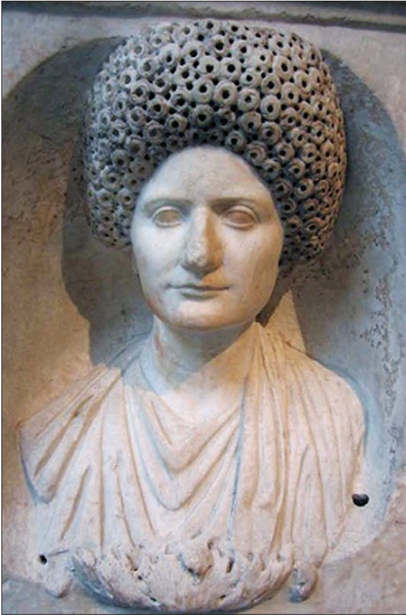
Fig. 16. Funerary altar of Cominia Tyche, the Metropolitan Museum (after Thompson 2007, 119, fig. 24).