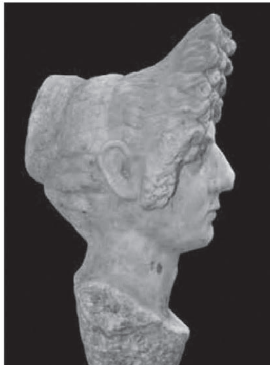
Fig. 13. Head of a Roman lady, the Museum of Apollonia (after Ceka 2017, 424–425, fig. 2).