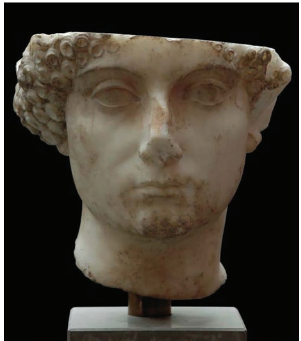
Fig. 8. Portrait head of a Roman lady, Copenhagen, inv. no. 747 (after Borg 2019, 139, fig. 3.7).