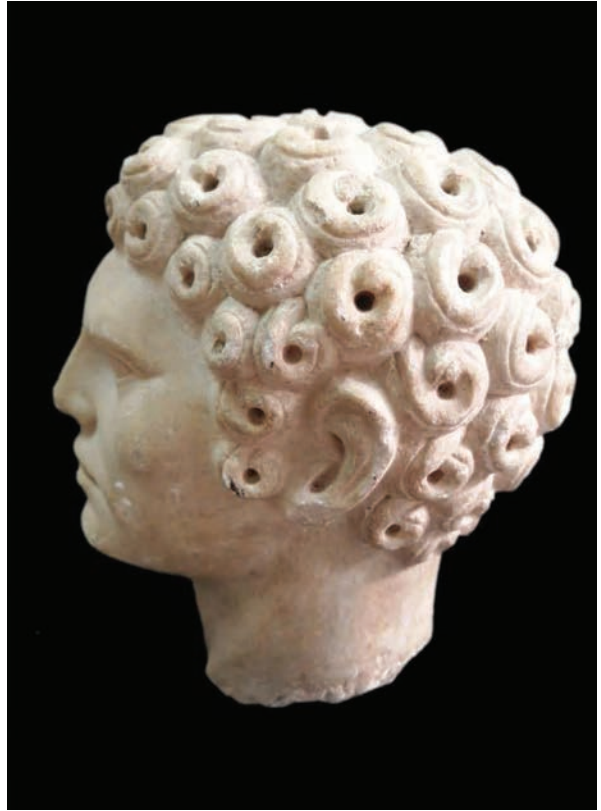
Fig. 2. Portrait head of a young man, the Maria Storeroom, inv. no. 218, side view.