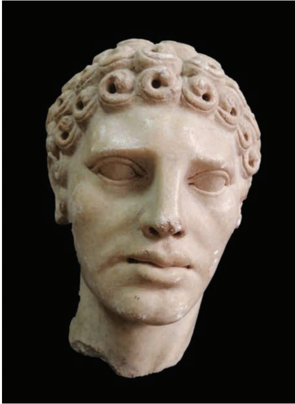
Fig. 1. Portrait head of a young man, the Maria Storeroom, inv. no. 218, front view.