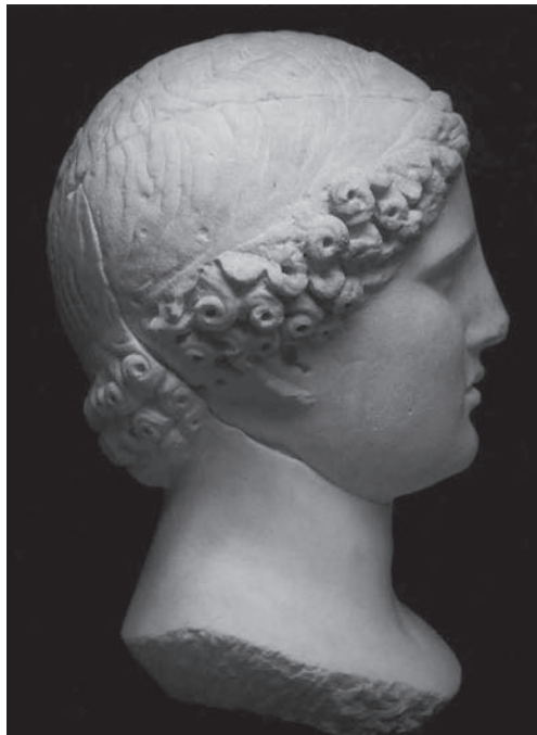
Fig. 18. Head of a Roman lady (after Romano 2006, 235–236, cat. no. 115).