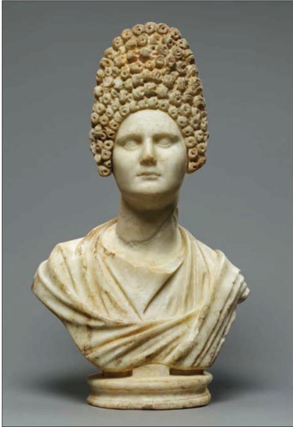
Fig. 11. Bust of a Flavian woman, the Getty Museum, inv. no. 73.AA.13 (after Frel 1981, 56, fig. 39).