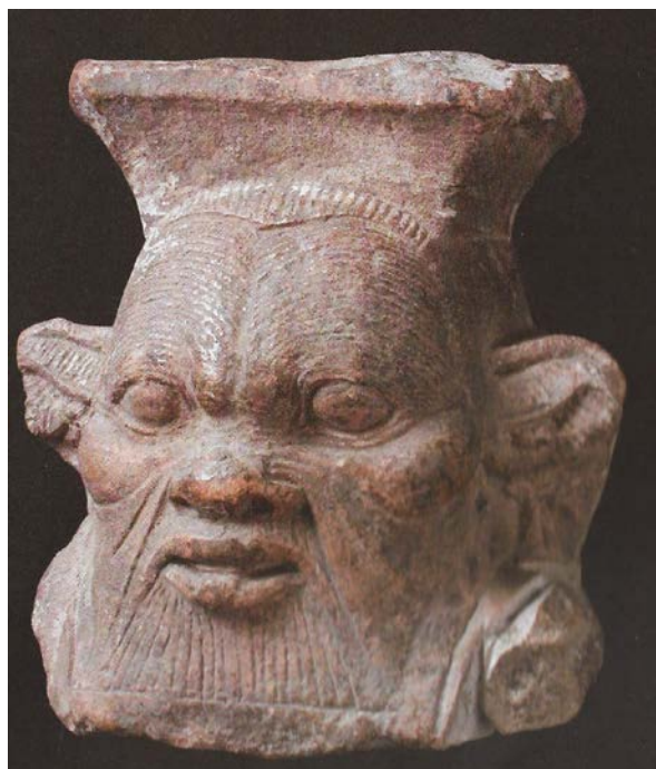
Fig. 9. Head of a limestone statue of Bes discovered at Wadi es-Sebua on 6 January 1862 (18 th Dynasty, 15 th –14 th century BC). The Lithuanian National Museum in Vilnius, IM 4960, on loan in the M.K. Čiurlionis Museum of Art, Kaunas. Photo after the exhibition catalogue Papyri, Mummies and Gold... , Warsaw 2011, 47.