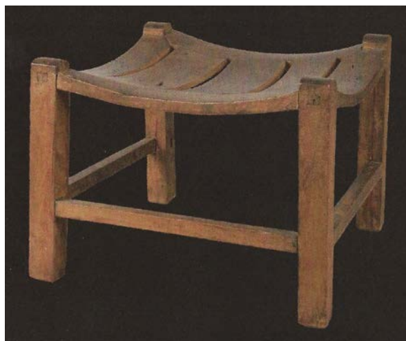
Fig. 4. Stool discovered in a tomb in Western Thebes on 18 December 1861 (18 th Dynasty, 15 th –14 th century BC). The Louvre Museum, E.3858, on loan in the National Museum in Warsaw, MNW 143344. Photo after the exhibition catalogue Papyri, Mummies and Gold... , Warsaw 2011, 70.

The presence of two mummies indicated a possibility that an entrance to a tomb could be situated beneath the excavated layer of debris. In fact, the discovery took place on the next day, 18 December 1861: