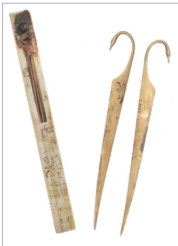
Fig. 6. Ivory scribal palette and the copper knife for cutting papyrus: the objects found in Lady Bakai’s coffin from the tomb in Western Thebes, discovered on 18 December 1861 (18 th Dynasty, 15 th –14 th century BC). The Louvre Museum, E.3669 and E.3673.

It seems that the identification of the find-spot of the tomb can be attempted. The illicit arrangement of the nightly excavations made between Tyszkiewicz’s interpreter, Petrus, and the guardians of the Necropolis concerned “a valley behind the mountains of Assasif”. For somebody standing within the circus of Deir el-Bahari, such localisation may have meant either the area situated southwards (the Valley of the Royal Cache, the Valley of the unfinished temple of Mentuhotep,