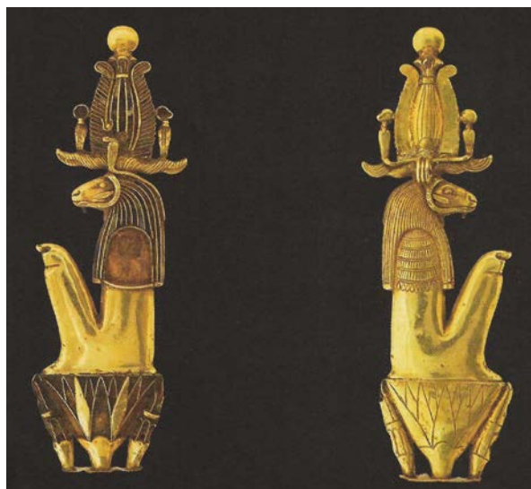
Fig. 3. Gold pectoral with the cryptographic name of Amon-Re on the mummy of Lady Nekhemes-Bastet discovered on 16 December 1861 in Western Thebes (22 nd Dynasty, 10 th –9 th century BC). The Louvre Museum, E.11074. Photo after the exhibition catalogue Papyri, Mummies and Gold... , Warsaw 2011, 62.

“Thus we started from this case. To my great surprise, however, the mummy contained within had nothing on itself, except for the common wrappings. The next mummy – although modest – placed in a beautifully painted case stuck of linen repaid double our efforts. I found in the case a woman’s body adorned with numerous gold jewels and figures of deities made of lapis lazuli. Thick gold ear-rings, two rings, and a gorgeous collar of the same material, decorated with cornelians [Fig. 3] – all this had the proper place on the corpse. A gold plaque with a hieroglyphic inscription laid on the breast; a bracelet of amethysts and cornelians strung on thread, and another one in the form of a serpent adorned the hands. A figure of the god Sawak made of crystal laid on her legs. 35 Delighted at this beautiful and rich prize I decided to continue digging in the promising valley, and sent immediately a generous baksheesh to my workmen to encourage them to further effort and research.” 36