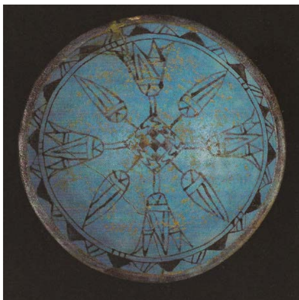
Fig. 5. Faience bowl analogous to the one discovered in a tomb in Western Thebes on 18 December 1861 (18 th Dynasty, 15 th –14 th century BC). The Louvre Museum, AF 6894.

in bed, but not sleeping, because strong excitement had fully robbed me of my sleep”. 37