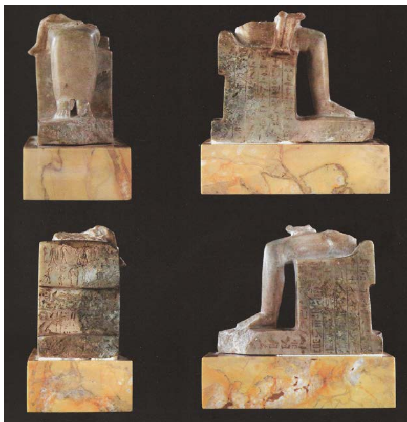
Fig. 1. Fragment of the stone figurine representing Isis with Horus-child on her lap. This object belonged to one of the first groups of antiquities discovered at Karnak on 13 December 1861 (26 th Dynasty, 7 th –6 th century BC). The Louvre Museum, E.3775.