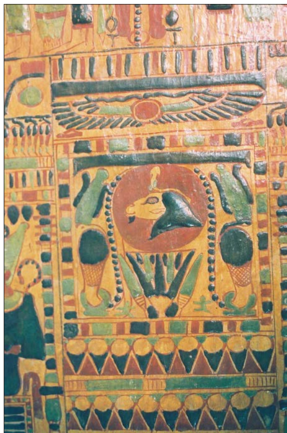
Fig. 2. Scene on the mummy-cover discovered on 16 December 1861 in Western Thebes. The scene depicts the Creator in the form of a sun-disc containing the head of a wider being, a cryptographic name for Amon-Re (Invisible One in his visible form = Sun) (21 st Dynasty, 10 th century BC). The Louvre Museum, E.3859.

"Having closed ourselves in the cabin, we began to open the two mummies. One of them is closed in a wooden case, very decorative one, which is covered with paintings: green and made in relief, while other paintings compared with the green ones are red and shallow; one can see this case in Paris, in the Department of the Egyptian Antiquities in the Louvre [Fig. 2]. 34