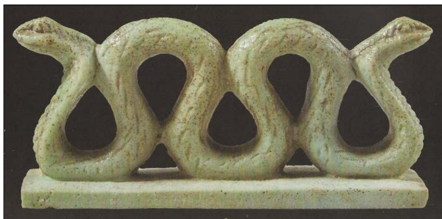
Fig. 8. Faience amulet in the form of a double serpent discovered in Thebes (26 th Dynasty, 7 th –6 th century BC). The National Museum in Warsaw, MNW 236847.

In the morning of 20 January, M. Tyszkiewicz examined the above-mentioned objects: "Only one of these mummies was distinguished by beautiful adornments, and in particular I rejoiced over two beautiful ear-ornaments of gold. The reader will find a drawing of these ear-ornaments in the tables which I do intend to attach to my diary, accompanied with a short text explaining the objects." 40 In one of the remaining mummies