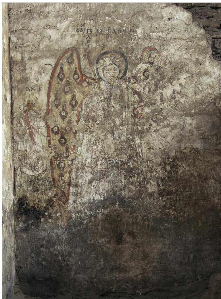
Fig. 4. Citadel. The naos of the Church of Archangel Raphael, the painting of Archangel Raphael, the end of the 8 th c. (photo by W. Godlewski, PCMA archive).

Among the commemorative inscriptions, one text stands out. It is located on the western pilaster supporting an arch between two parts of the southern pastophorium ( diakonikon ). The eight-line text preceded by the Alpha and Omega symbols commemorates a local synod of the Makurian Church organized during the reign of King Ioannes by the local bishop Aaron. The synod was attended by Ioannou, bishop of Pachoras (designated as metropolites ), NN, bishop of Upper Ounger, Chael, bishop of Sai, Mena, bishop of Phrim, Markou(?), bishop of Kourte, and three other bishops with the names Mena, Chris[---] and Ignatios, whose sees' names did not preserve in the text. The bishops gathered on a Wednesday in the month of Choiak (November/December) and spent a week together "making fruitful use of spiritual guidance" and "enjoying it". 2 The inscription is of great historical value. It testifies to