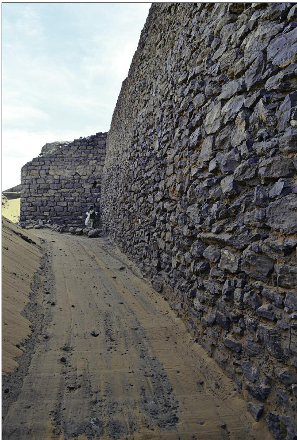
Fig. 1. Citadel. The curtain wall of fortifications with the tower NE (photo by W. Godlewski, PCMA archive).

Ryc. 1. Fragment fortyfikacji dongolańskiej cytadeli, kurtyna i baszta NE (fot. W. Godlewski, archiwum CAŚ).