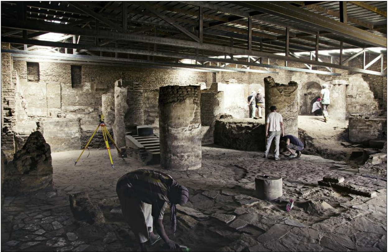
Fig. 2. Citadel. The naos of the Church of Archangel Raphael (SWN.B.V) during exploration. Ryc. 2. Cytadela. Kościół Archaniola Rafała (SWN.B.V). Wnętrze w trakcie badań.