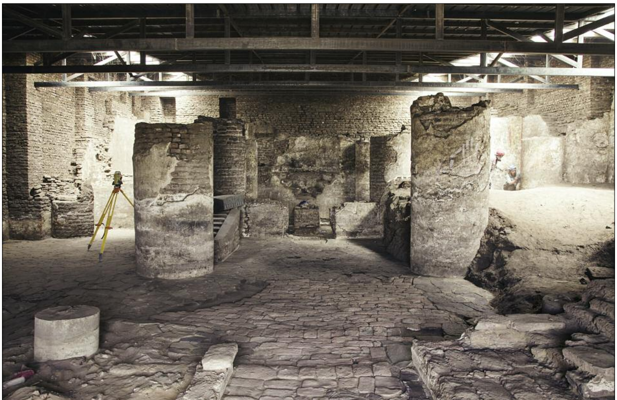
Fig. 3. Citadel. The naos of the Church of Archangel Raphael, the view from the west (photo by M. Reklajtis, PCMA archive). Ryc. 3. Cytadela. Naos kościoła Archaniola Rafała, widok od zachodu (fot. M. Reklajtis, archiwum CAŚ).