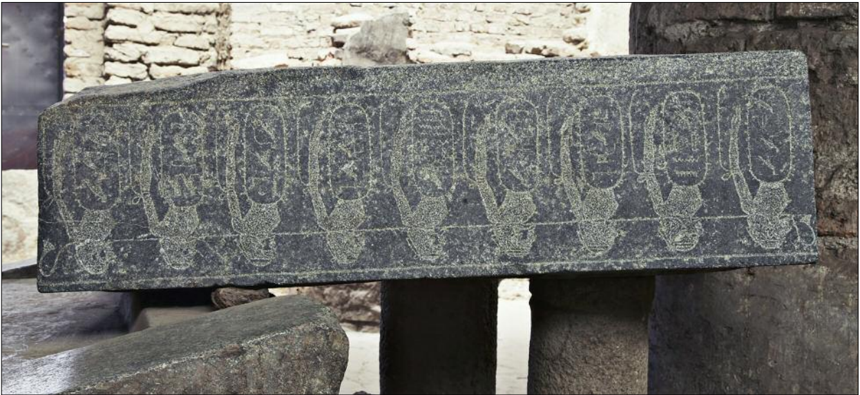
Fig. 5. Citadel. The naos of the Church of Archangel Raphael and the base of a statue reused in the pulpit, in situ , granite (photo by M. Reklajtis, PCMA archive).

Ryc. 5. Cytadela. Naos kościoła Archaniola Rafaela, granitowa baza posągu użyta w konstrukcji ambony ( in situ ), (fot. M. Reklajtis, archiwum CAŚ).