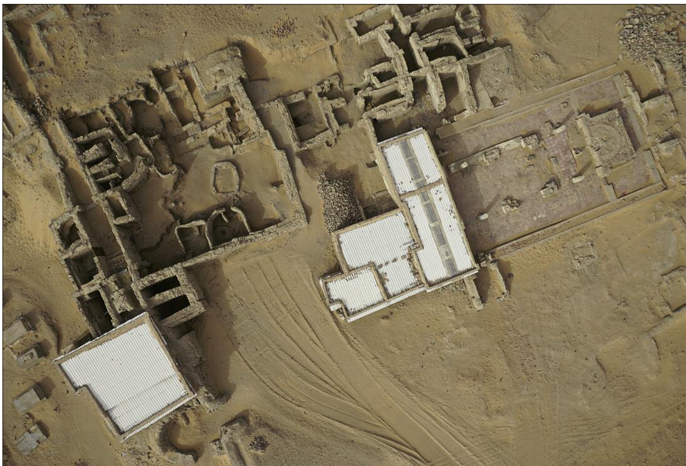
Fig. 6. Kom H. The aerial view of the monastery – the church, Central Building, Western Building, and Courtyard A.

The courtyard showed evidence of multiple phases of use. In the earliest, the courtyard area was limited to the southern ca. 10 metres of the monastic enclosure, while the northern part was occupied by a part of a building