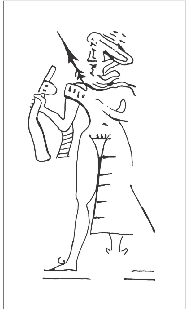
Fig. 2. Detail from the seal impression BM 16815 u. After MESSERSCHMIDT 1988: 37, fig. 3

Unfortunately, for it would have constituted crucial evidence, there is no example in the iconography of the use of this weapon in battle. However, the virtually identical image in two completely independent representations of the duckbill axe seems a significant clue. The reliability of this image is further reinforced by the considerable remoteness of the places where the representations appear. Moreover, the Egyptian painting was