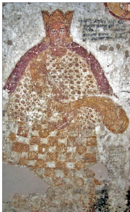
Fig. 9. Portrait of a Queen Mother, painting from the Cathedral of Petros in Pachoras

The rules behind how the regalia are arranged in the painted composition are not known. One thing is for sure: they are not a matter of artistic convention. They may have been conditioned by the dynastic traditions of the two dominions of Arwa and Makuria. Members of the royal family depicted wearing crowns in the churches and official buildings of Makuria (there is no evidence available from the territory of Arwa) are identified unequivocally as the currently ruling king and the dead king; the paintings come from commemorative buildings, such as the Monastery and the Church of Georgios in Dongola, and the Upper Church in Banganarti. The Queen Mother