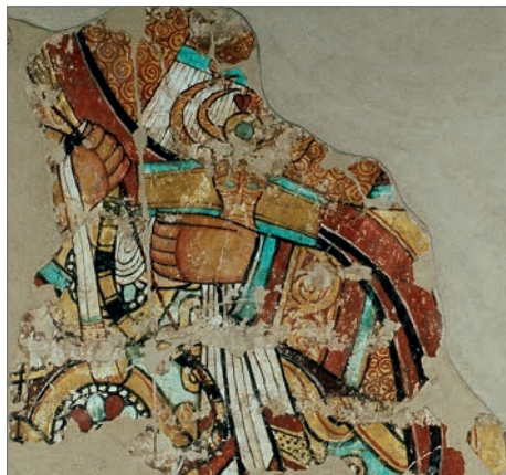
Fig. 8. King with a bow and a crown in his hand, painting from the Cathedral of Petros in Pachoras

The rules behind how the regalia are arranged in the painted composition are not known. One thing is for sure: they are not a matter of artistic convention. They may have been conditioned by the dynastic traditions of the two dominions of Arwa and Makuria. Members of the royal family depicted wearing crowns in the churches and official buildings of Makuria (there is no evidence available from the territory of Arwa) are identified unequivocally as the currently ruling king and the dead king; the paintings come from commemorative buildings, such as the Monastery and the Church of Georgios in Dongola, and the Upper Church in Banganarti. The Queen Mother