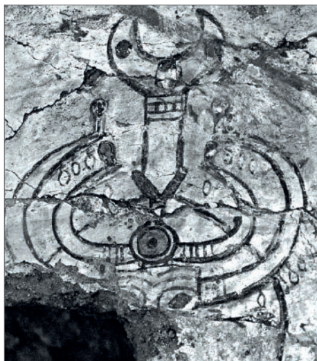
Fig. 7. King wearing a Nubianizing crown, painting from the Cathedral of Petros in Pachoras

on their heads; surviving fragments of “something” on their heads alone justify the suggestion. This is, however, not the case of the discussed well preserved image from the monastery church in Dongola.