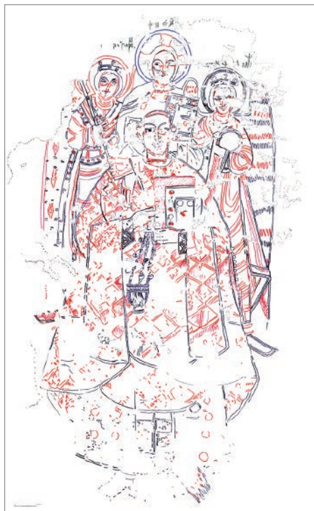
Fig. 3. The presbyter in composition with other figures, Church of the Archangel Raphael (SWN.B.V) in Dongola (PCMA UW-QSAP Dongola Project | drawing D. Zielińska)

political structure of Makuria (Dotawo) and Arwa as kingdoms in a union, but preserving their own traditions (including the regalia). The Nubianizing crown on the king's head is a high vaulted helmet surmounted with a cross and a pair of horns curving upward [Fig. 6 top]. Four pendants are suspended from the horn tips on either side and there are two small birds depicted sitting on the tips, near the cross. A similar crown with birds sitting on the horns is held by a ruler de-