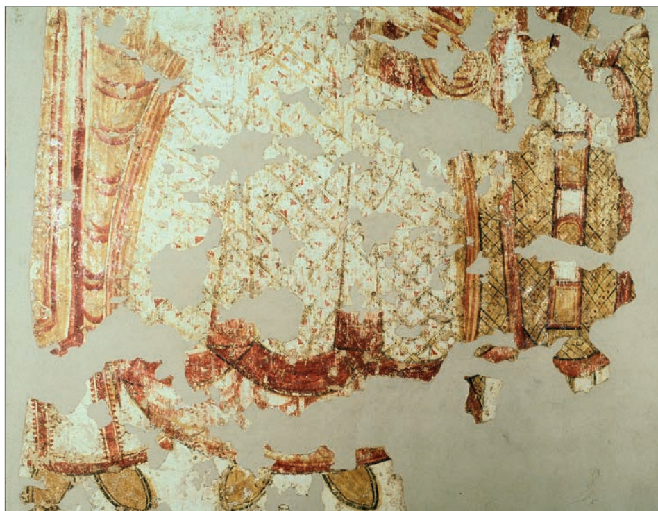
Fig. 10. Royal dress: figure of a king(?) under the protection of Christ, painting from the Cathedral of Petros in Pachoras

complete and recognizable, is that there are no noticeable differences between what the king wears and what the