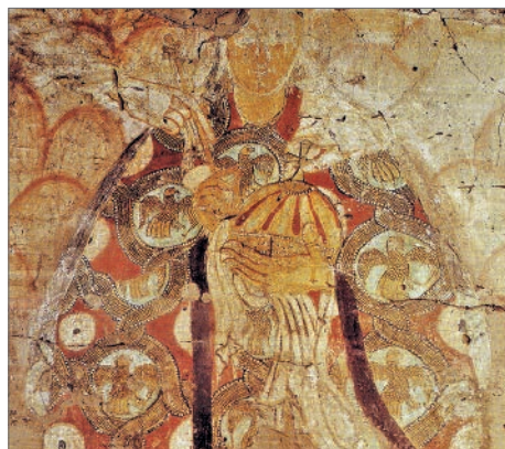
Fig. 4. The Queen Mother under the protection of the Makurian Holy Trinity, painting from the Northwest Building of the Monastery in Dongola