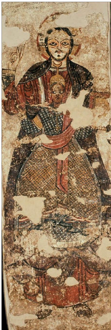
Fig. 11. Royal dress: figure of a king, painting from the sanctuary of the Late Cathedral in Pachoras

A very interesting study has been made of the garments of figures painted in the apses of the Upper Church in Banganarti (Woźniak 2016). The paintings are dated from the mid-11th through the 14th century. The army of the Sultan Baybars destroyed the church in Banganarti as a symbol of royal authority rather than as a church. The cathedral in Dongola was left untouched. The Church of the Archangel Raphael (SWN.B.I) survived the destruction of the nearby palace. The ruins of the church in Banganarti continued to function as a place of pilgrimage frequented by the Makurians who left there numerous graffiti (Łajtar 2014). The last portraits of rulers were painted probably in the 13th century. Woźniak's suggested changes in the attire of kings and queen mothers concern two aspects. The king wore three garments: the inner tunic as an undergarment, the outer garment which was like a skirt held up by a strap across the right shoulder, and a shawl across the left forearm and right shoulder. The decorative nature of the outer garment resembles robes produced in the caliph's textile workshops. In a few cases even fragments of inscriptions in the Arabic script can be discerned.