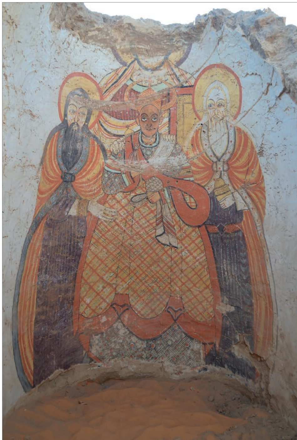
Fig. 2. The King in composition with other figures, painting from the northwestern apse of the Church NB.2.2 in Dongola