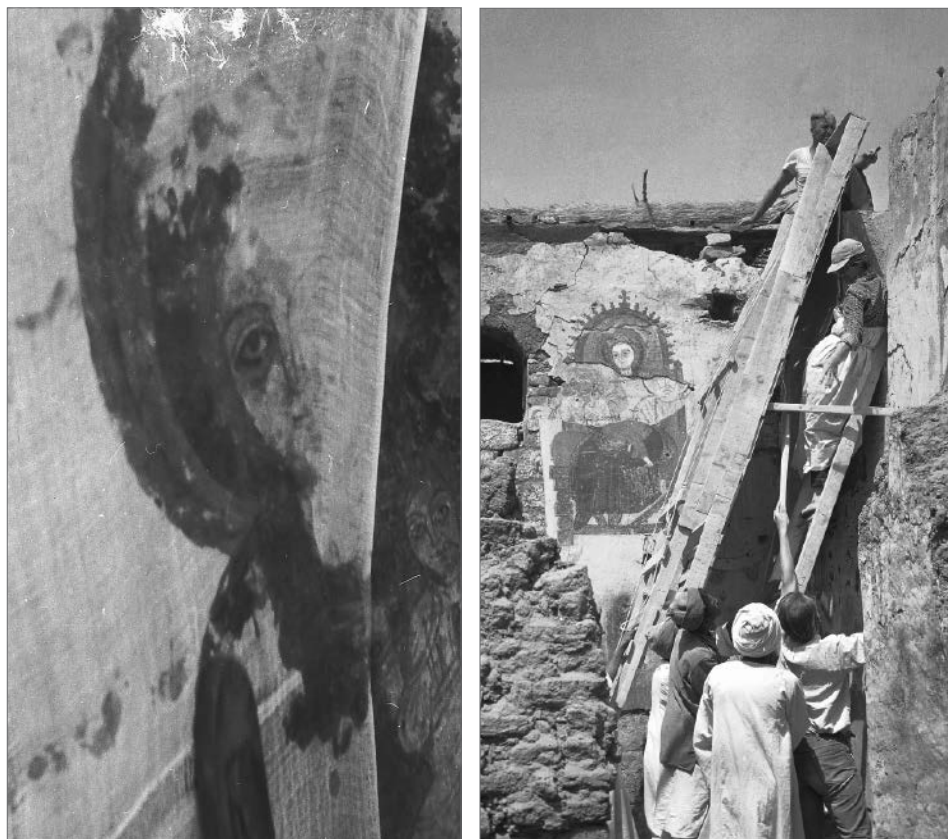
Fig. 2. Cathedral in Faras: restorers taking down wall paintings for transport and preservation in the National Museums of Khartoum and Warsaw; left, surface of saintly figure protected before removal from the wall

and with support from his university and approval from both the Polish and Egyptian authorities, he founded the Centre of Mediterranean Archaeology of the University of Warsaw, the first Polish scientific institution in Egypt. He regarded the foundation of this institute, which he headed until his death in 1980, as his greatest life achievement. It was indeed the highest form of recognition of Michałowski's esteemed position in scientific circles. The official inauguration of the institute's office in the district of Heliopolis in April 1960 was attended by