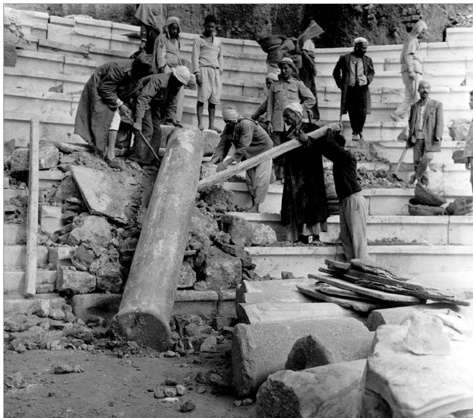
Fig. 3. Clearing the cavea of the Roman theater in Alexandria, 1965

Gebelein, Asasif, and recently Berenike on the Red Sea. Research expanded in the Near East: Tell Arbid, Tell Qaramel, Hawarte, all in Syria, Chhîm/Jiyeh in Lebanon, Beit Ras and Khirbat al-Sar in Jordan. New sites were opened in Sudan: Banganarti, Selib, Ghazali and the region of the Fourth Cataract, el-Zuma and el-Detti. New directions of research led to excavations in Kuwait (Bahra), and recently on the Arabian Peninsula (Aynuna), in the UAE (Saruq al-Hadid) and in Oman (Qumayrah), as well as Armenia (Metsamor) and Georgia (Gonio). The latest projects in Ethiopia (Debre Gergis)