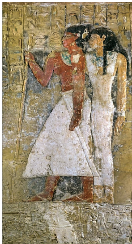
Fig. 4. Conservation challenge: painted wall reliefs from the Tomb of Merefnebef in west Saqqara

Recent years have witnessed fundamental changes: the Centre has developed new objectives and research clusters reflecting the changes in its staff structure, opening the way to an ever broader participation of Polish specialists in archaeological, documentation and conservation projects. Multidisciplinary approaches to archaeological research have