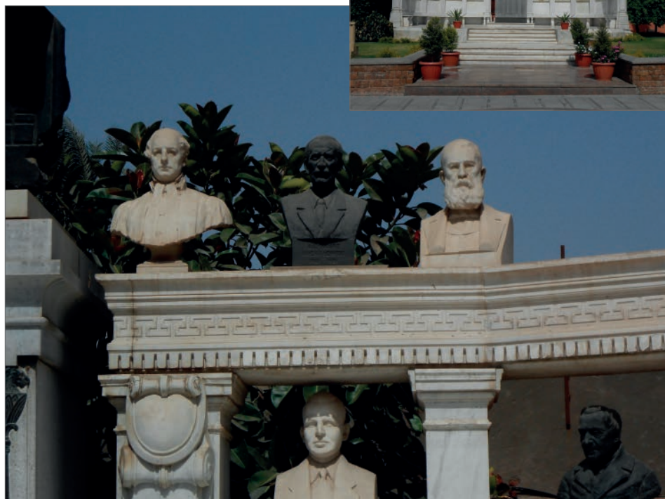
Fig. 5. Bust of Michałowski (cast bronze, by Ewa Parandowska) in the pantheon of scholars of ancient Egypt, Cairo 2008

The Research Centre is also a place for networking and presentations of the latest results of research by Polish and foreign archaeologists working in Egypt. As part of the community archaeology approach, the Centre organizes exhibitions, among others in Egypt, to present past and current work, educating the general public in the most important and impressive discoveries. And just like in Nubia years ago, the Centre responds to international calls to save world cultural heritage endangered whether by natural factors, economic development or warfare.