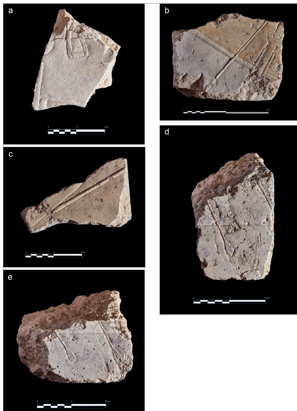
Fig. 5. Identified blocks: a – loops of rope and part of a steering oar from the last of the middle set of tugboats in Scene A (fragment); b – stern of the last tugboat from the uppermost row in Scene A, with part of a steering oar and rope (fragment); c – part of a boat and long rope from Scene A (fragment); d – oars in water (fragment); e – oars in water (fragment)