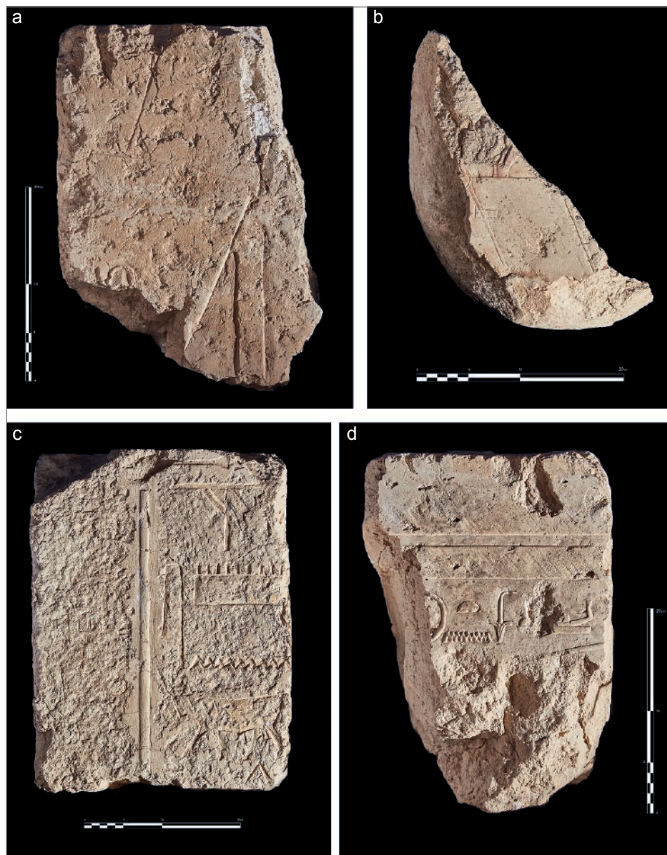
Fig. 3. Identified blocks: a – part of the crown and feathers of Amun, restored under Ramses II (fragment of block); b – oarsman (fragment of block); c – beginning of the name of Amun-Kamutef (restored under Ramses II) from the northernmost scene of the portico (block); d – inscription above the last of the tugboats in the lowest row (block)