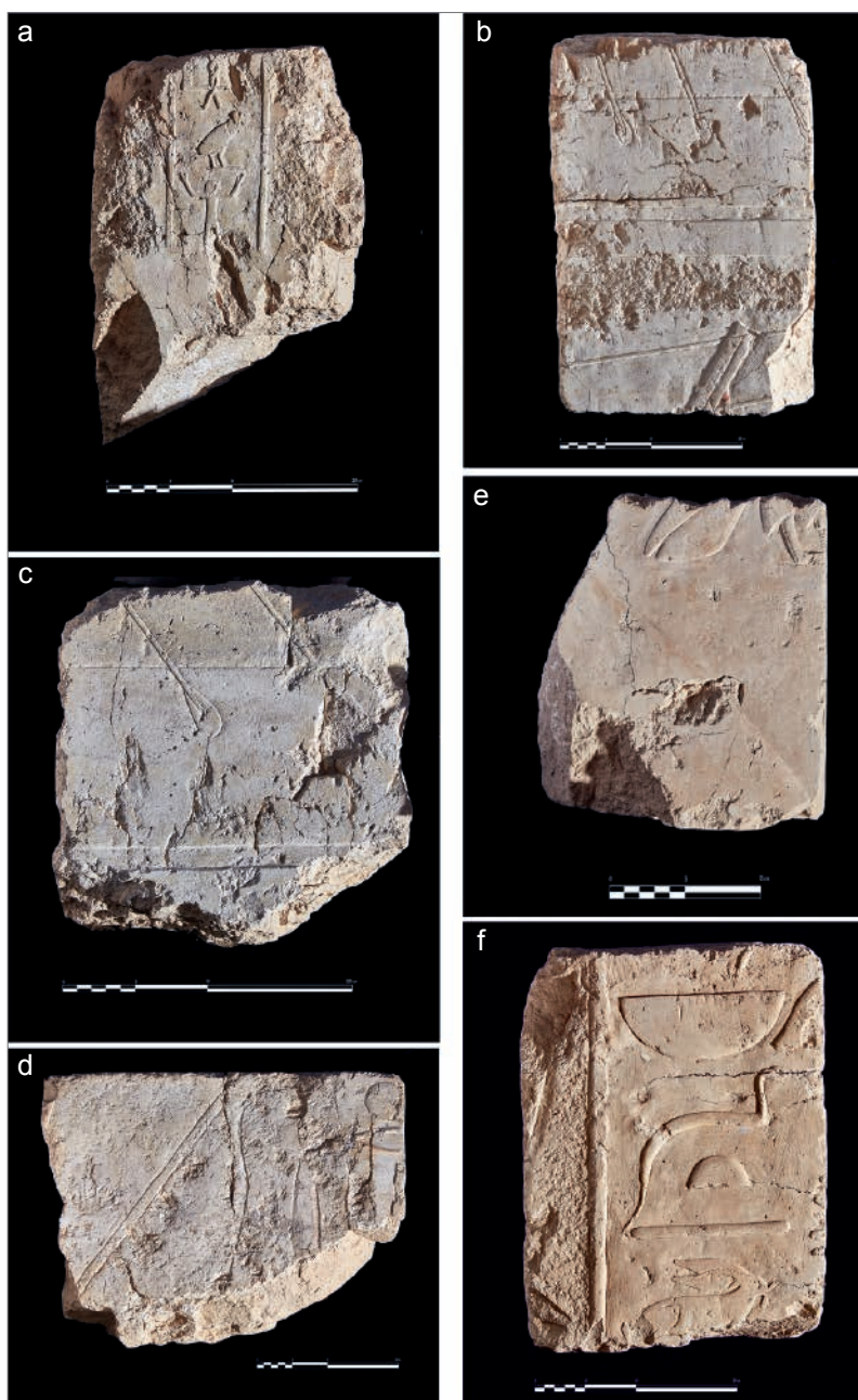
Fig. 2. Identified blocks: a – inscription above the barge with the obelisks (fragment); b – parts of tugboats nearest to the barge carrying the obelisks in the upper and middle row (block); c – oars from the upper row of tugboats (fragment); d – part of the shoulder and raised arm of Amun restored under Ramses II (fragment); e – part of the white crown of Thutmose III from Scene C (fragment) ; f – fragment of inscription behind Thutmose III and small fragment of the feathers of Amun from Scene B