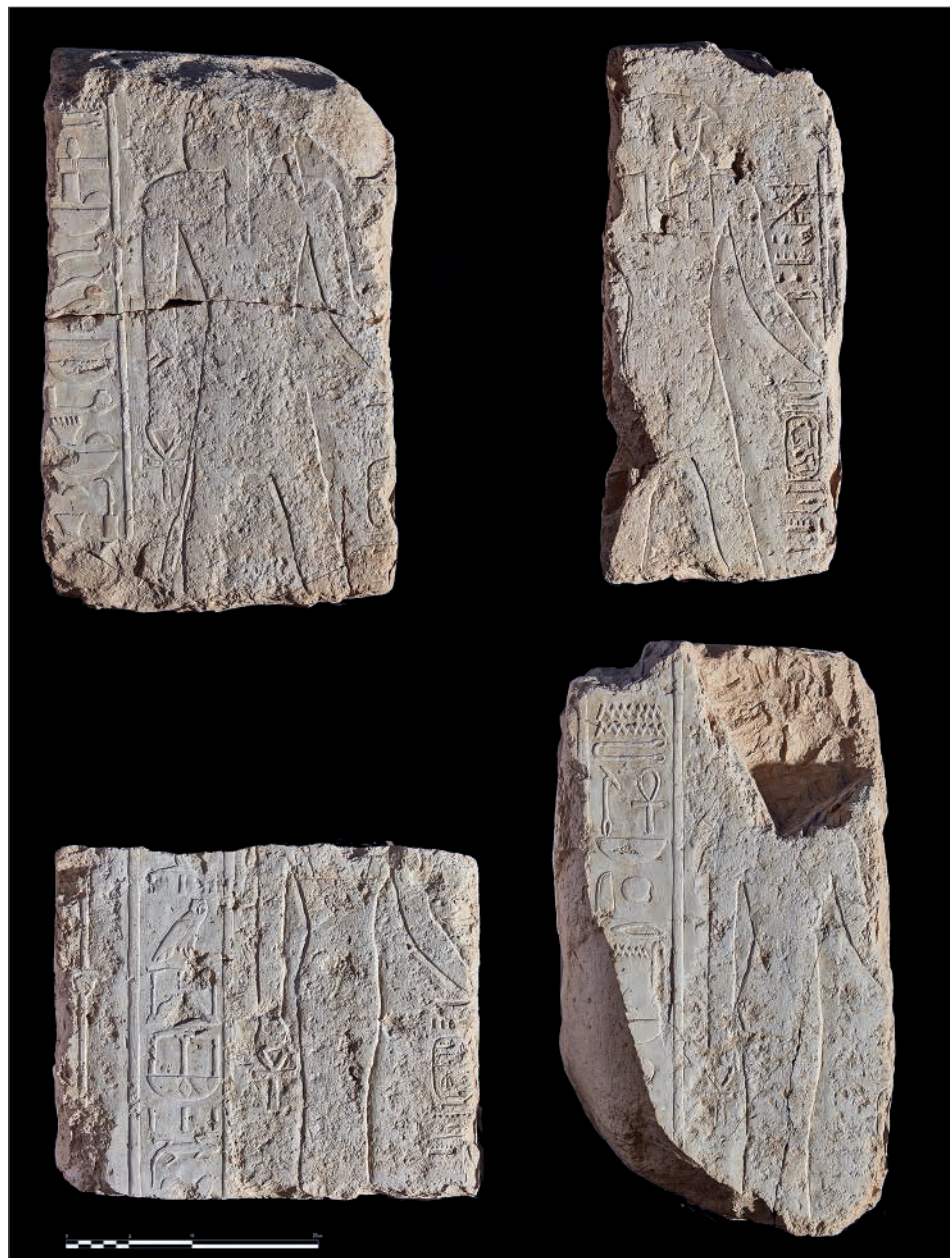
Fig. 1. Deities from the procession of gods above the scene of the transport of the obelisks