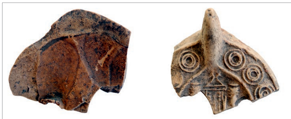
Fig. 2. Oil lamp PN 51: upper part with a fragment of the discus and the underside with fingerprints of the maker impressed in the clay

The lamp is made of fine, slightly porous clay with some fine white sand, brown inclusions and very fine mica. It is light brown (7.5YR6/4) in color. The surface is dusty and soft with a residue of diluted red slip (2.5YR4/8). The slip is well preserved on the underside except for the edges in the breaks, which are