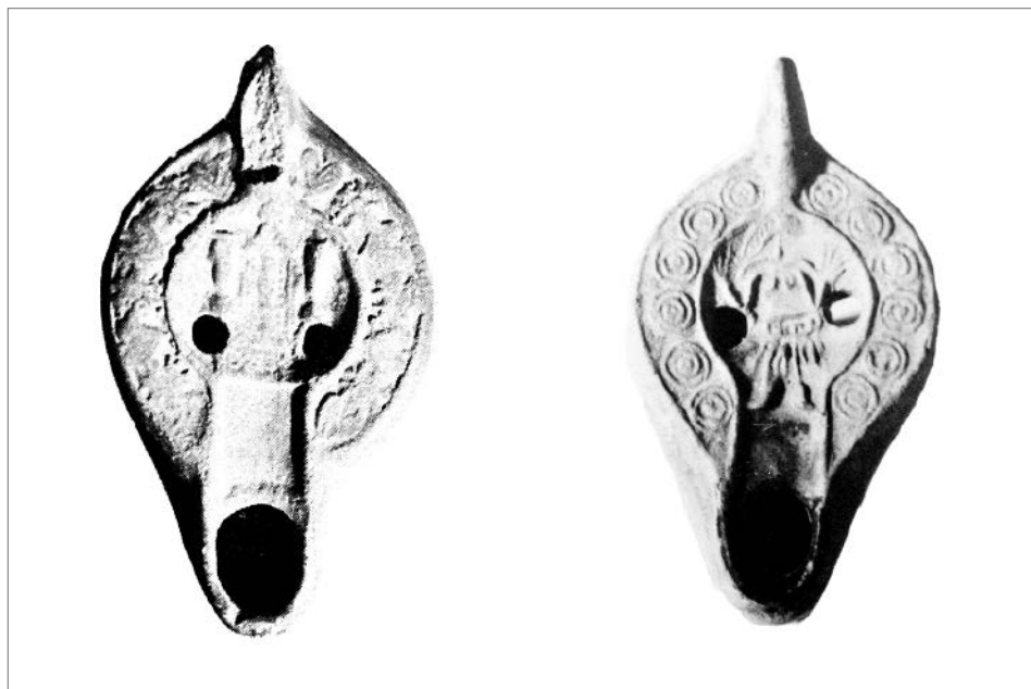
Fig. 3. Parallels for lamp PN 51 from Ajdovščina: left, lamp from Mactar bearing an image of a tabernacle flanked by two columns on the discus; right, lamp from Ravenna with a series of concentric circles decorating the shoulder (After Bourgeois 1980: Pl. VIII:54 [left]; Berti 1983: Fig. 9.2 [right])

Based on the shape of the fragment, this lamp may be a copy or imitation of a classical African lamp type Atlante X