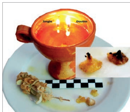
Fig. 2. Loumini wicks: top, single calyx, and upper left, double stacked calyces; bottom, post-use calyces used as a double loumini wick (lower calyx on left, upper calyx on right)

Once the fuel ran out and the flames died, the two calyces used in the double test were separated and photographed [see Fig. 2]. Note that the lower calyx (on the bottom left) shows much less evidence of burning!