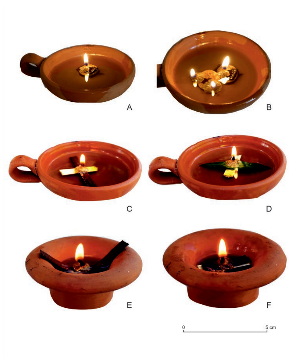
Fig. 3. Floating loumini wick tests: A – with cork and leather (single loumini wick sitting on a rectangle of leather which sits on a small disk of wine cork); B – variations with cork and leather (on left, two loumini wicks resting, one on each end of a narrow strip of leather which rests on a circular slice of wine cork, neither wine cork nor leather pierced; on right, one loumini wick resting on a square piece of leather on top of a slice of wine cork (both wine cork and leather have a hole pierced in them); C – with giant fennel (single loumini wick sits on a narrow strip of leather which sits perpendicular to and on top of a strip of dried stem from giant fennel); D – with giant fennel and olive leaf (single loumini wick sits on an olive leaf which sits on and perpendicular to a strip of the dried stem from giant fennel); E – wick sitting on a leather sling; F – wick sitting on leather on giant fennel