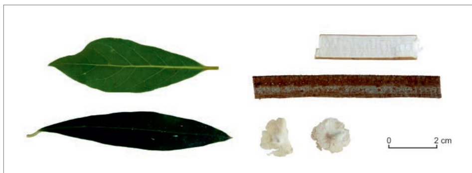
Fig. 4. Floating wick components: left from top, bay and olive leaves; top right, slice of giant fennel stem; center right, strip of leather; bottom right, loumini wicks)

since, according to Hesiod ( Theog. , 567; Op. , 52), Prometheus after stealing the fire from Zeus brought it to mankind in a hollow fennel stalk. We took a piece of dried stem and shaved the sides to make a fairly flat float on which to rest the leather, using a strip of leather of the same dimensions that had been