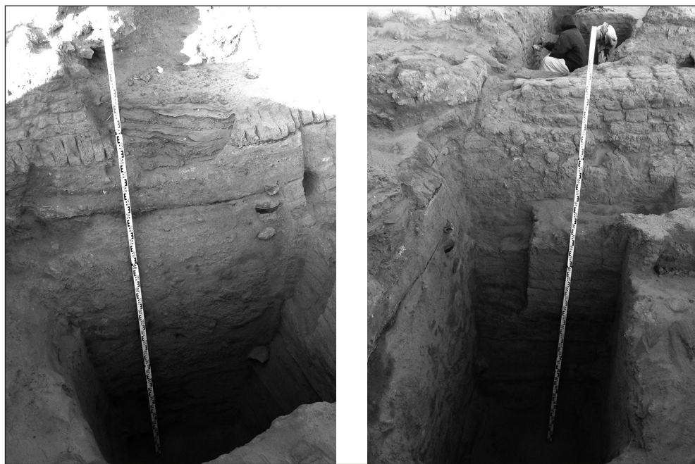
Fig. 4. Trench 12/2016: left, view from the northeast; right, inner face of the curtain wall (phase 1)

The lower layer of burning and ashes in trench II/1 started 5.50 m below the benchmark and was up to 0.25 m thick. The corresponding layer in trench A/2016 started 5.80 m below the benchmark, but was also correspondingly thicker (up to 0.60 m), so the upper boundaries of matching layers were on a similar level.