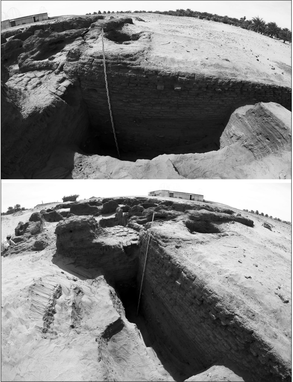
Fig. 5. Trench A/2016: top, view from northeast; bottom, view from the north