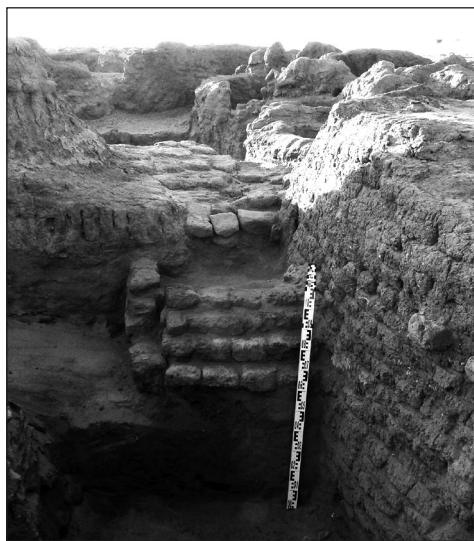
Fig. 2. Staircase and the passage on top of the fortifications

whole area was divided into twelve sections and the area closest to the inner corner of the fortifications was labelled as No. 12 [see Fig. 1 ].