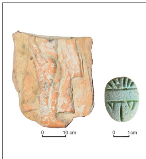
Fig. 5. Terracotta appliqué and scarab