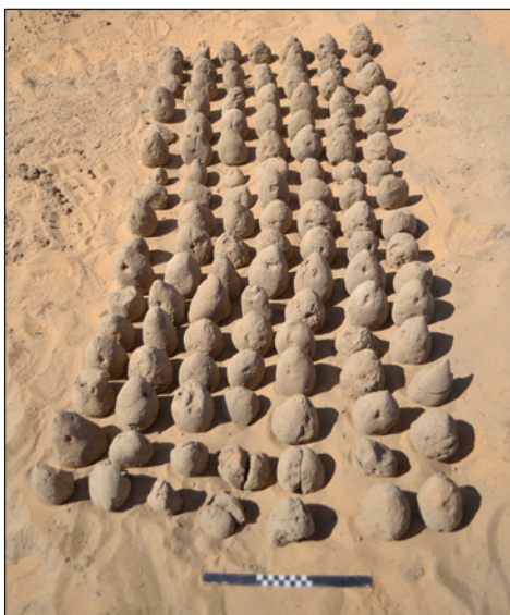
Fig. 7. Loom weights from House 2

House 2, which was larger but poorly preserved, consisted also of six rooms, but in different arrangement; two rows of three rooms, all of similar size from 8 m 2 to 10 m 2 , were separated by a central corridor, presumably entered from the east [see Fig. 1 inset]. The foundations were three brick courses high at the most. Walls were made of a single row of unfired mud bricks of typical size 16 cm by 32 cm and 17 cm by 34 cm. Mud stoppers (plugs) were evidenced in the walls between the rows of bricks, similarly as in the walls of the workshops excavated in the southern part of the site.