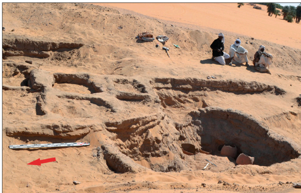
Fig. 8. Units A–G: general view from the east