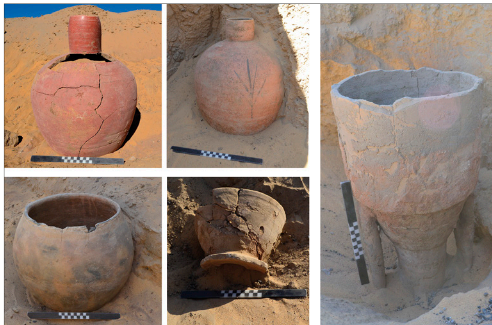
Fig. 6. Pottery in situ from Houses 1 and 2: top left, storage jar; top center, storage jar with incised decoration; bottom left, cooking pot; bottom center, brazier/offering stand; right, amphora half