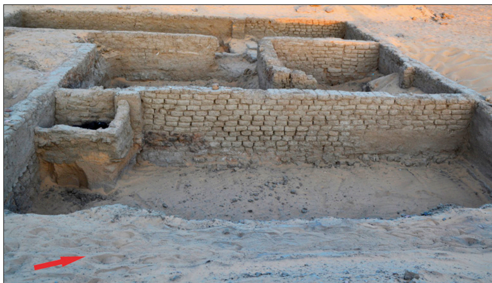
Fig. 3. Room 4, view from the east

Tall storage jars and handmade cooking pots were found in the corners of all of the