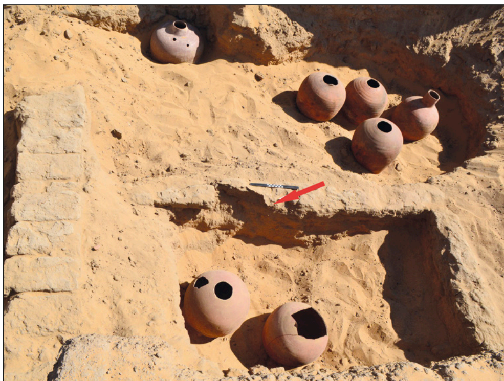
Fig. 2. Rectangular annex and cooking jars in situ in unit 1

Distinct traces of ashes and soot were recorded on the walls of the structure