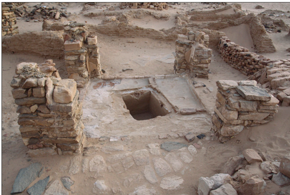
Fig. 4. The water tank and associated building, looking north