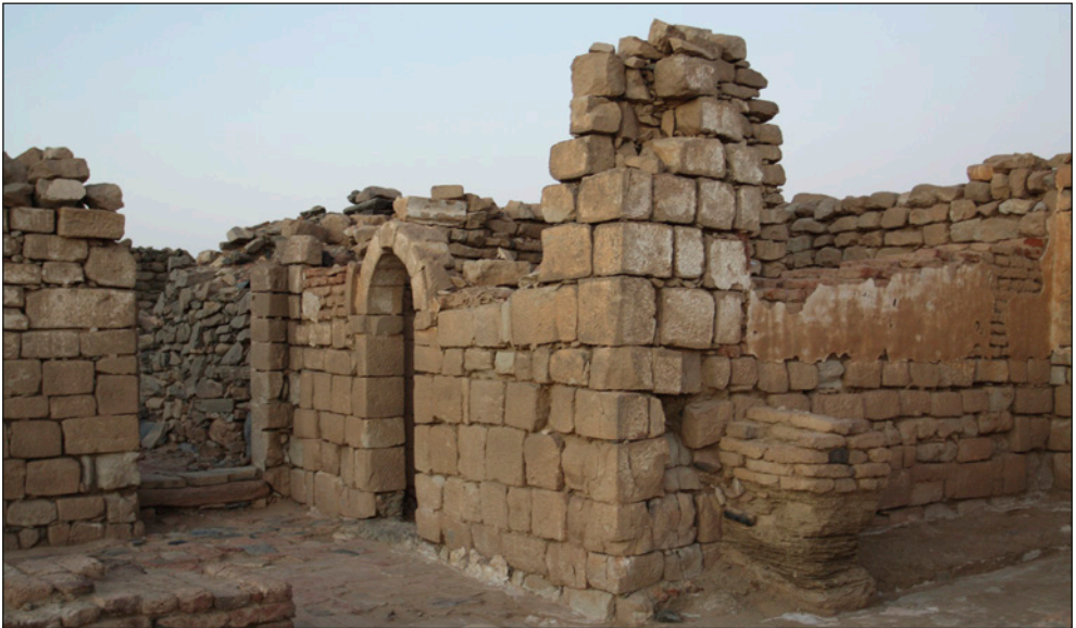
Fig. 5. Staircase room located in the southwestern corner of the church; visible remains of the baked brick structure of the upper walls

The western end of the church was divided into three separate rooms. The southwestern chamber contained a staircase consisting of three flights of steps [Fig. 5]. The entrance was located in its east wall and was crowned with an arch,