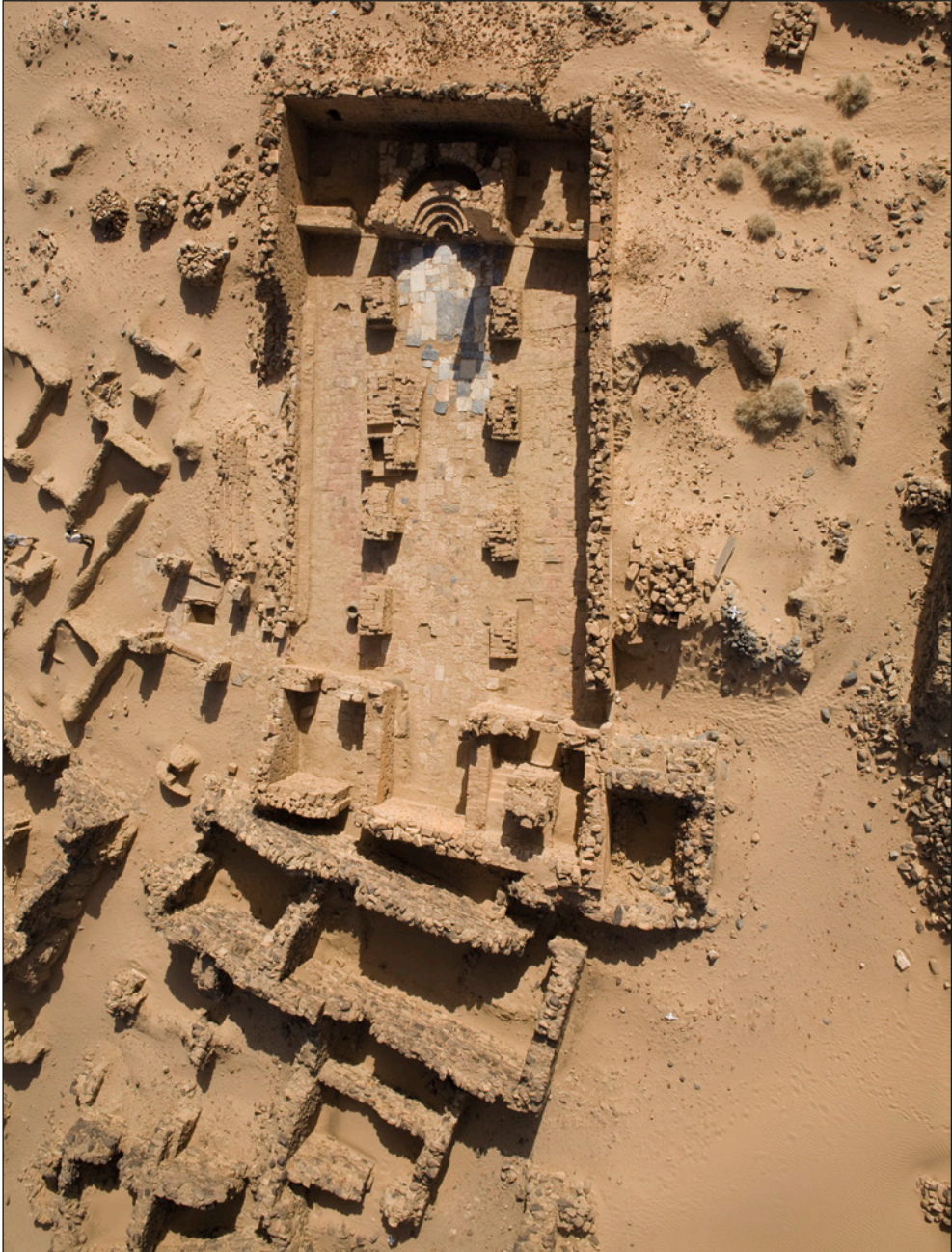
Fig. 6. Kite photograph of the North Church