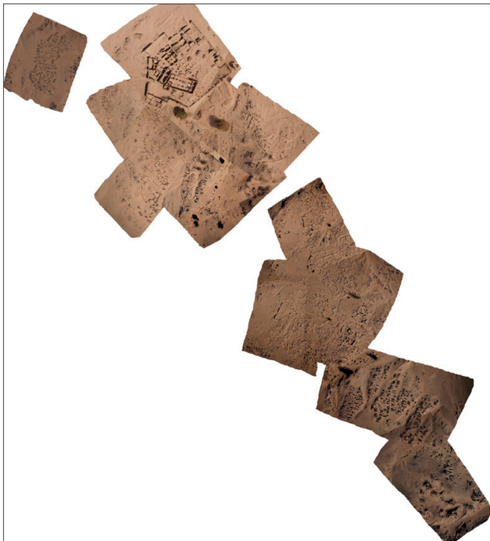
Fig. 2. Orthophotomap of the concession (north at top)

of 2–13 m/s. Structures of the Ghazali monastery, cemeteries and settlement were clearly visible from the air, especially in the early morning and late afternoon.