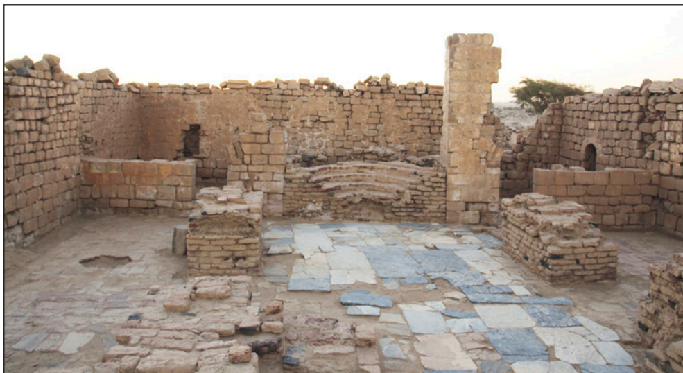
Fig. 3. The presbytery of the North Church after cleaning