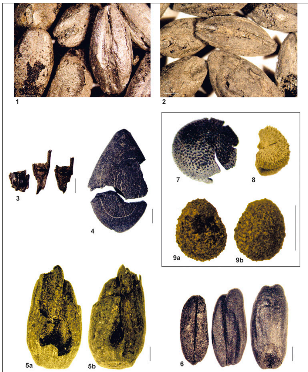
Fig. 4. Charred plant macroremains from the site of Tell Arbid: 1–3 – Hordeum distichon (glumed), 1 – grains from sample 12, 2 – grains from sample 17, 3 – rachis internodes (chaff) from sample 71; 4 – Prosopis farcta from sample 46; 5–6 – Aegilops cf. crassa , 5 – spikelet from both sides with two grains inside, from sample 8, 6 – grains from sample 3; 7 – Vaccaria sp. from sample 71; 8 – Silene sp. from sample 46; 9 – Heliotropium type from sample 57. Scale bars equal 1 mm (Photos A. Mueller-Bieniek; processing K. Cywa)