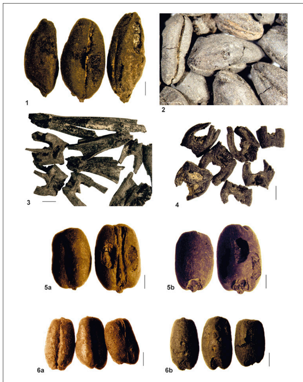
Fig. 3. Charred plant macroremains from the site of Tell Arbid: 1–4 – Triticum sp. (glumed), 1 – grains from sample 12, 2 – grains from sample 17, 3 – chaff from sample 71, 4 – chaff from sample 27; 5–6 – Triticum sp. (naked), grains from sample 14 from dorsal and ventral side. Scale bars equal 1 mm (Photos A. Mueller-Bieniek; processing K. Cywa)